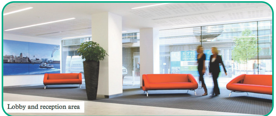
Lobby and reception area